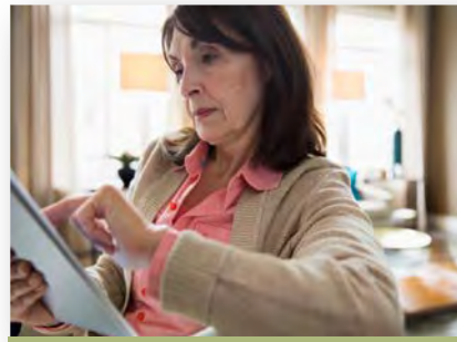
Tablets / iPads